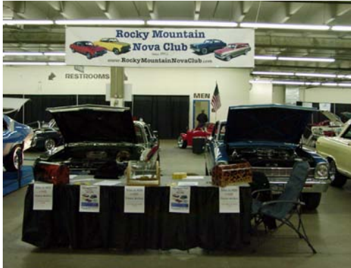
Club Display 2008